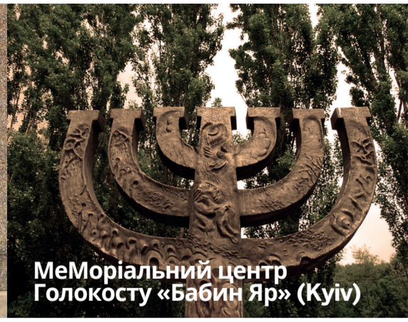
Меморіальний центр Голокосту «Бабин Яр» (Kyiv)