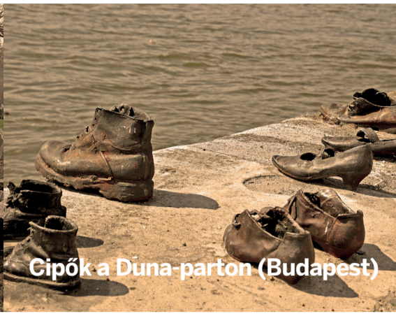
Cipők a Duna-parton (Budapest)